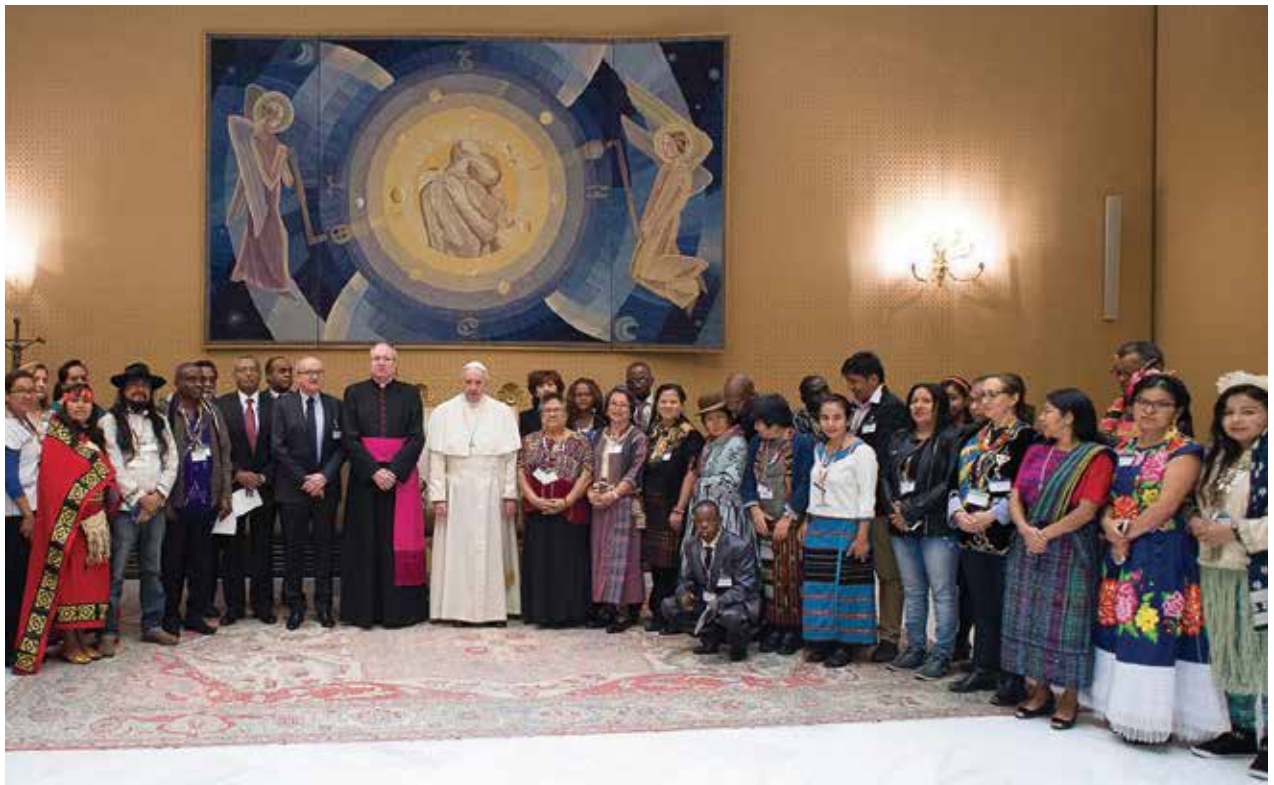
Pope Francis receives the indigenous delegation in a private audience